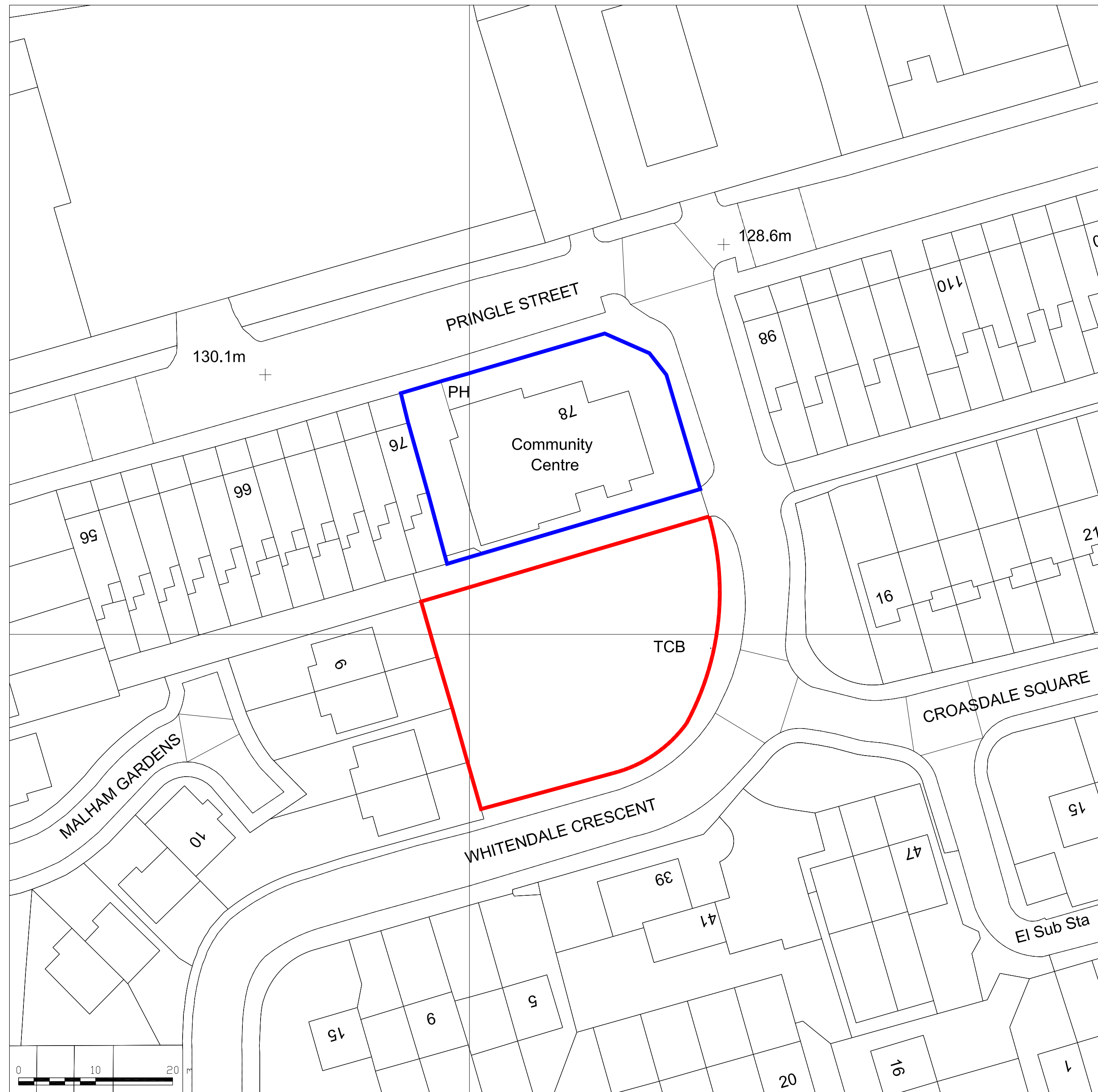
LOCATION PLAN SCALE 1:400@A1